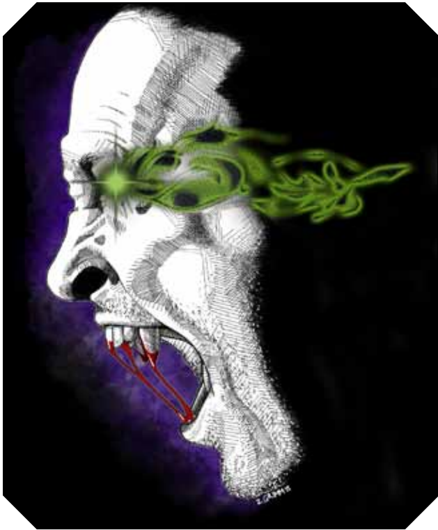
'Untitled' Zuri Grimm - artpunxstudio.com Mixed Media

Blood magic is rarer among the Anarchs than in any other sect.